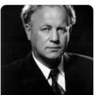
Ásgeir Ásgeirsson 1894–1972