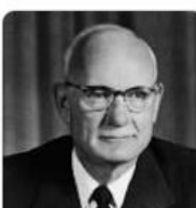
J. C. Hall 1891–1982