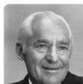
Sam Walton 1918–1992