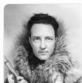
Richard E. Byrd 1888–1957