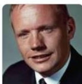
Neil Armstrong 1930–2012