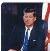
John F. Kennedy 1917–1963