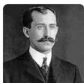
Orville Wright 1871–1948