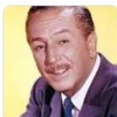
Walt Disney 1901–1966