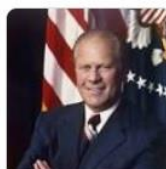
Gerald Ford 1913–2006