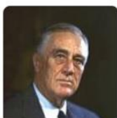
Franklin D. Roosevelt 1882–1945