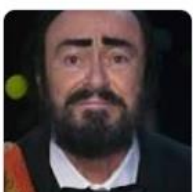
Luciano Pavarotti 1935–2007