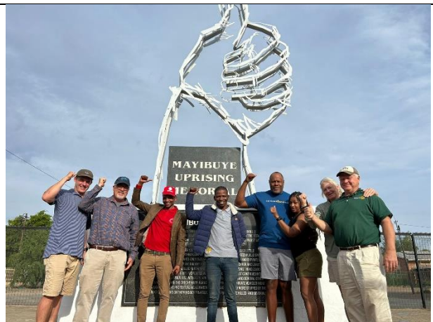
Rotary working with the Galeshewe Youth Network