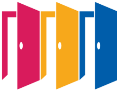
Rotary Opens Opportunities

In stressing the need for Rotary members to embrace change, Knaack noted that time won't slow down for Rotary: "We will not let rapid change defeat us. We will capture this moment to grow Rotary, making it stronger, more adaptable, and even more aligned with our core values."