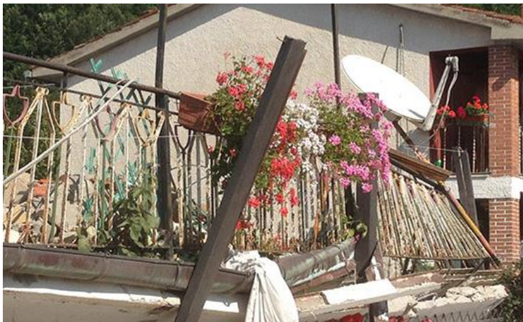
Geraniums hang from the railing in front of a house destroyed by the earthquake in central Italy

Geraniums which once brought joy now are a sad reminder of a happy home that is no more. Outside, near the rubble-strewn lawn, is a crushed car, parked by the driver who returned home a few hours before the earthquake.