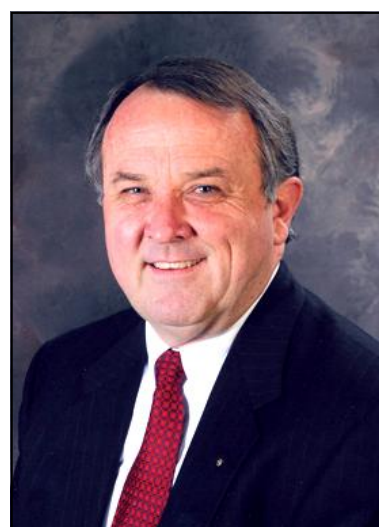
RI President Elect 2013-14 Ron Burton

Before the assembly, Burton asked each of the incoming governors to make a donation in their name to The Rotary Foundation in order to demonstrate leadership by example. At the assembly, he announced that all 537 governors-elect had complied; along with donations from all RI Board members and Foundation Trustees, the contributions totaled US$675,412.